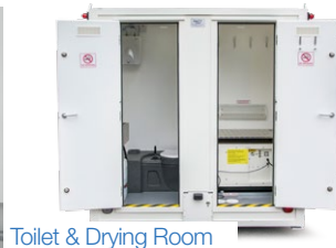
Toilet & Drying Room