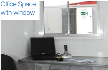
Office Space with window

Canteen & office facilities with separate toilet and drying room.