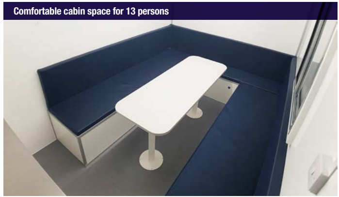
Comfortable cabin space for 13 persons